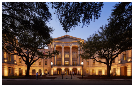
VENUE: Gaillard Center, Charleston, SC

"The Award for Conservation Excellence brings a critical focus to the world's dedicated conservationists, and the common ground shared by sportsmen and conservationists. Historically, responsible hunters and fishermen were the first conservationists in all cultures around the world, and today responsible sportsmen contribute significantly to game and fish management and research. This award honors the basic science and conservation upon which modern wildlife management is based. When sportsmen, scientists, and conservationists act together we comprise an enormous constituency that can protect public lands, habitat, and fish and wildlife populations."